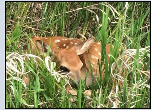
White-tailed deer are an iconic game species in Minnesota.