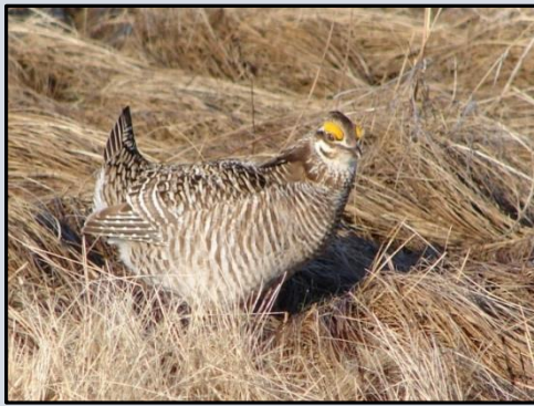
Prairie-chicken populations have been in decline for the past decade in Minnesota.

Corn, soybean, and wheat seeds are coated with neonicotinoids. These seeds become available to wildlife during the planting season via seed spills.