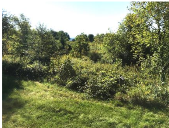
River Heights Park, Inver Grove Heights – FMR will establish native prairie and pollinator plantings, and remove invasive and non-native plants such as the invasive shrubs pictured here.

All sites are within the Mississippi National River and Recreation Area corridor.