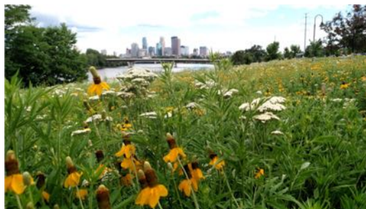
Ole Olson Park, Minneapolis – Additional restored acres will add to, and resemble, this land restored in Phase I.