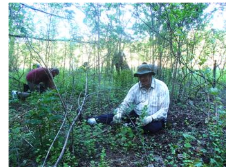
Minneapolis River Gorge – This project will remove both woody and herbaceous invasive plants - like the garlic mustard and buckthorn pictured here. Native species will be planted, improving wildlife habitat.