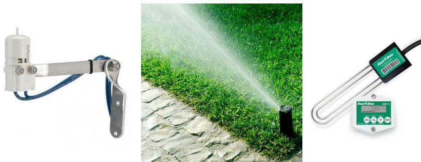
rain and soil moisture sensors