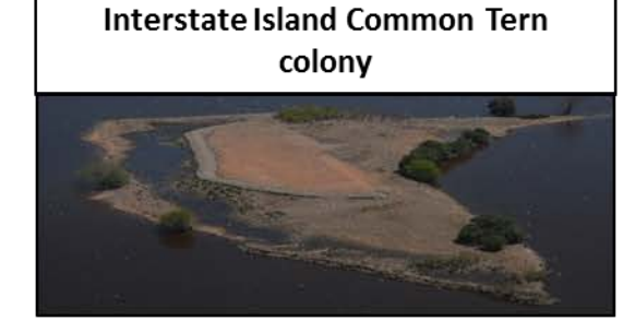
Track migrating and resident bird species