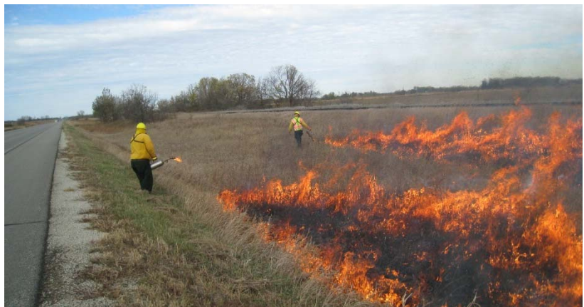
Figure 3: Prescribed fire in progress on a roadside prairie remnant