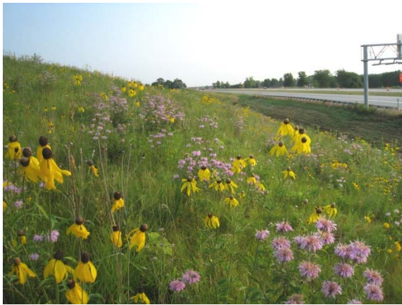
Figure 1: Roadside native grass and wildflower planting