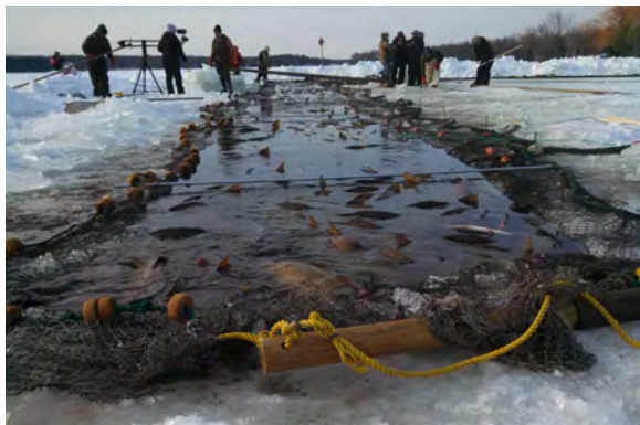
targeted winter carp removal

* public lands shown are those that overlap the subwatershed