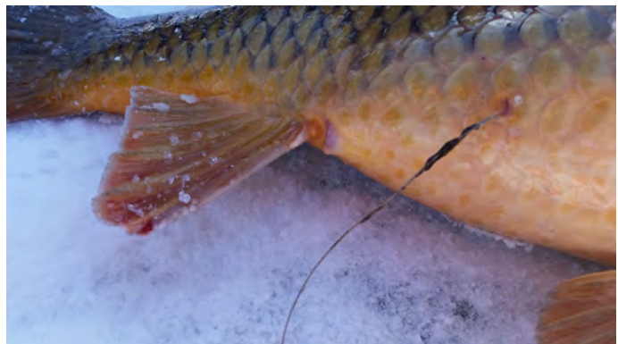
carp with surgically implanted radio telemetry device