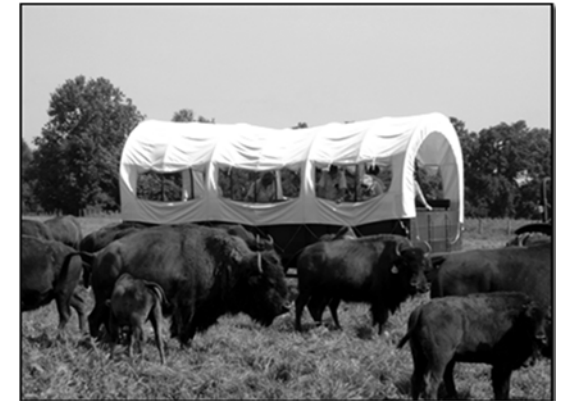
Example of Off-Road Safari Vehicle to Provide Close-up Observation of Bison and Prairie Ecosystems ADA accessible, 12 passenger, minimal impact to prairie